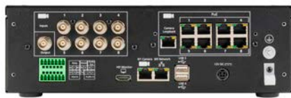
Eight analog ports and eight IP ports

16-channel hybrid recorder for a combination of up to eight analog and eight IP cameras or up to 16 IP cameras, with built-in PoE